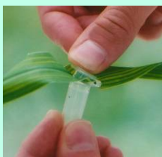
Obtain leaf tissue (two punches)