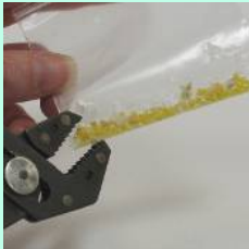
Crush single seed