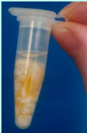
Extract seed sample