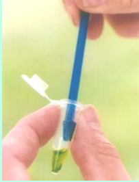
Grind tissue, add Buffer