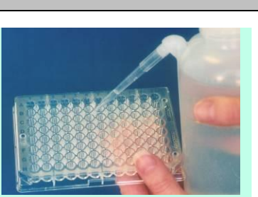
Bottle Wash method