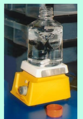
Prepare wash buffer and grain extraction solutions

NOTE: Thorough mixing of the bulk grain sample and determination of an appropriate sampling plan are critical to the results of this testing, and are the responsibility of the user of this test kit. The USDA/GIPSA has prepared several guidance documents to address the issues involved in obtaining representative grain samples from static lots - such as trucks, barges, and railcars - and for taking samples from grain streams.